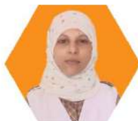
Umama (Roll no- B2603605) MUSLIM WOMAN RANK 4