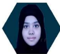
Tooba (Roll no- B2605281) MUSLIM RANK 14