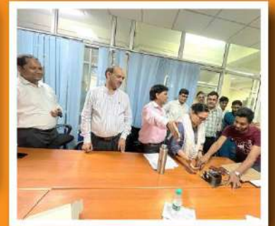
PHOTO GALLERY SOME MEMORABLE MOMENT OF OUR INSTITUTION EHTESHAM LAW